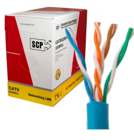
UL/ETL; CMP, CMR, CM, LSZH CPR EuroClass: Dca to B2ca