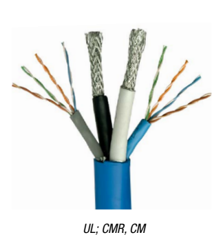
STRUCTURED / COMPOSITE