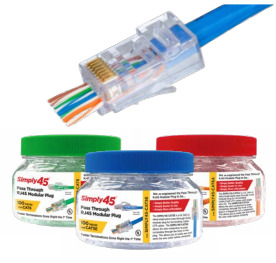
Plenum Rated, UL94 VO