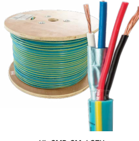
UL CMP, CM; LSZH CPR EuroClass: Dca